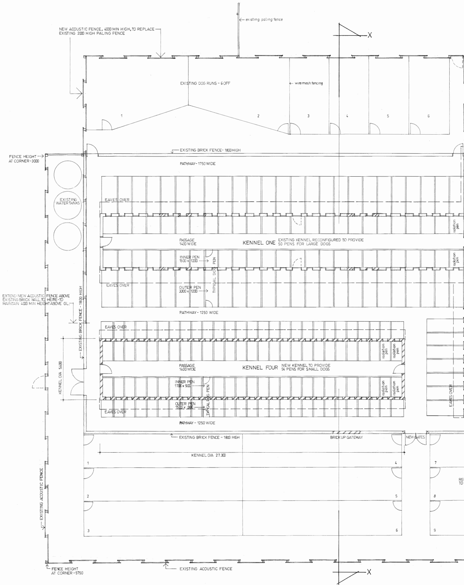
Above are the partial plans of the proposed kennel redevelopment and extensions at the SADS Yarrambat Property. Although difficult to read in such a small format we hope that these will convey some idea of the proposals which have now been approved. Full size and comprehensive plans of all the elevations will be on view at the 30th Anniversary Dinner.